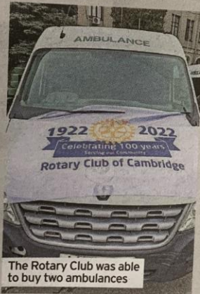
The Rotary Club was able to buy two ambulances

All supplies have been delivered to Kharkiv, which is the second largest city in the country and the location of some of the most serious attacks.