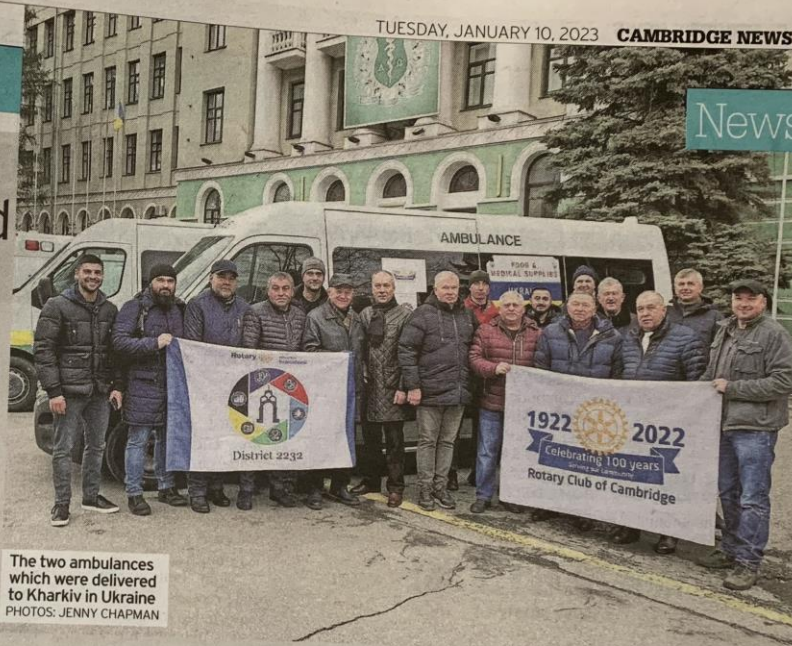
The two ambulances which were delivered to Kharkiv in Ukraine