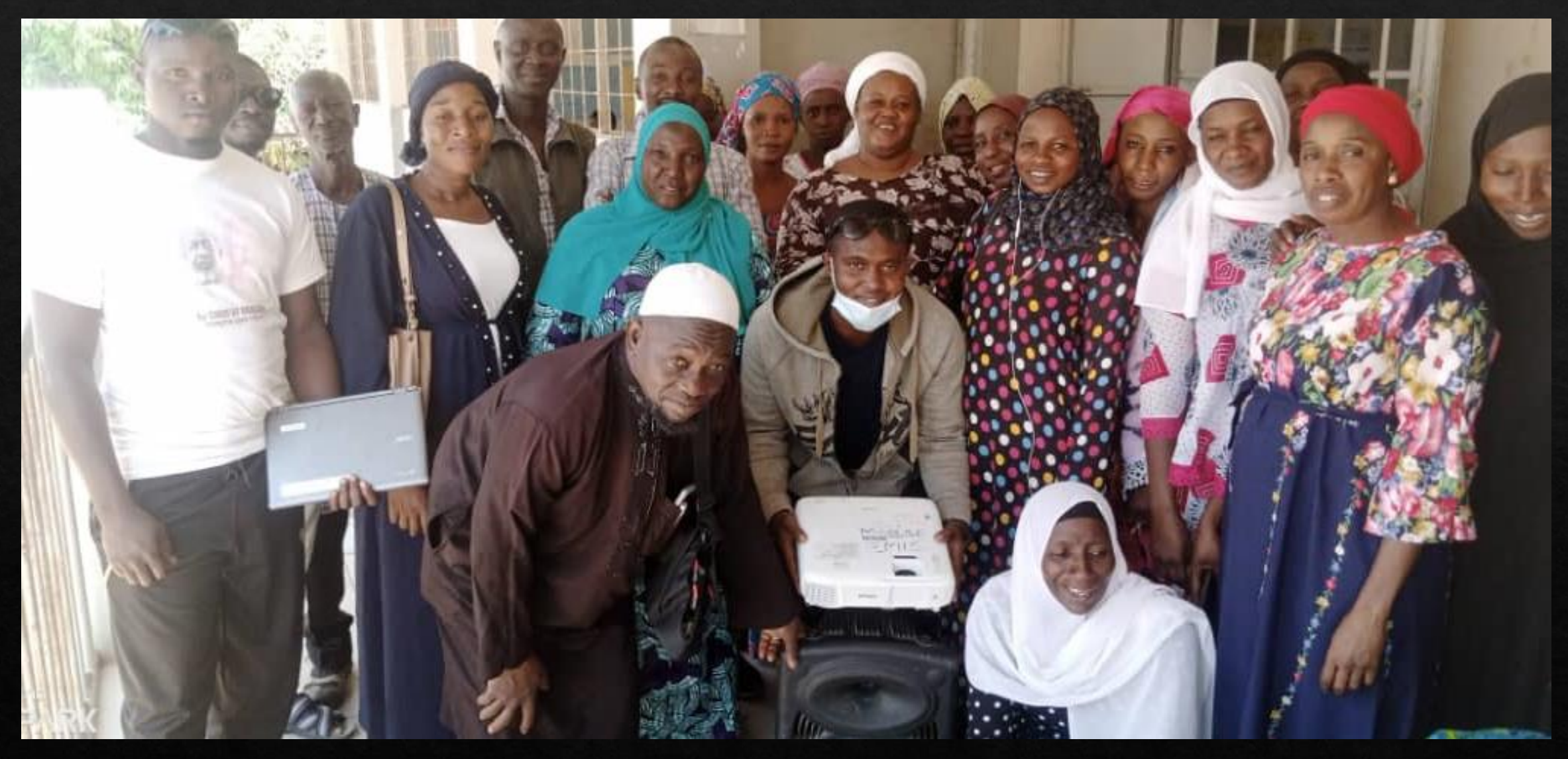
56 teachers are currently being trained.